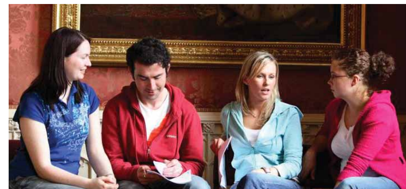
Students training in hypnosis.

Teaching takes place on interspersed Saturdays from September to December and February to June following the university academic year. Students may commence their studies at two entry points each year; September and February.