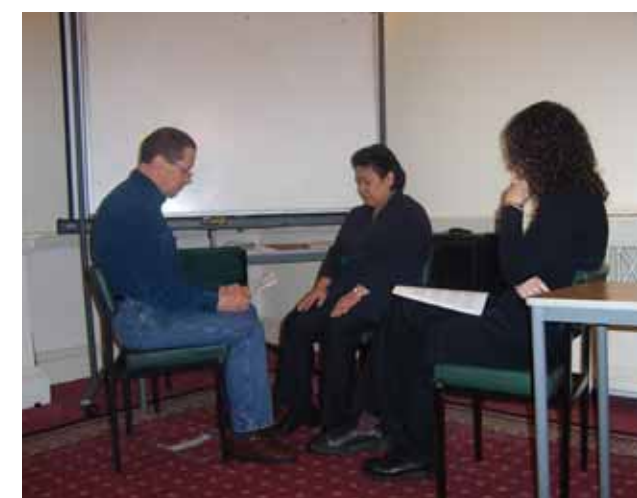
Students practising hypnotic inductions under supervision