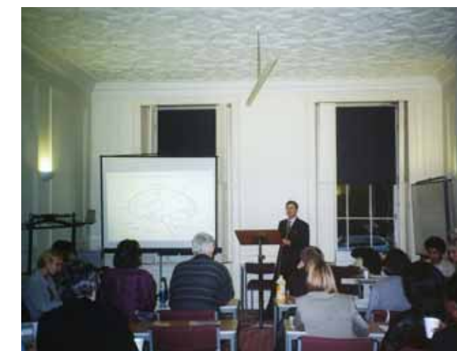
Students attending a lecture