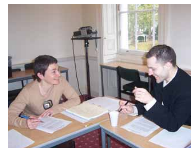
Students enjoying the course