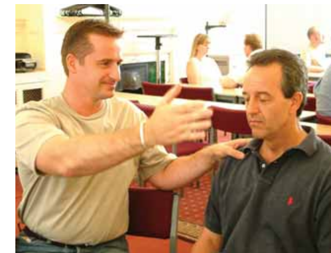
A rapid eye defocus induction