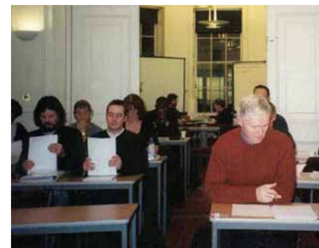
Students studying on the course