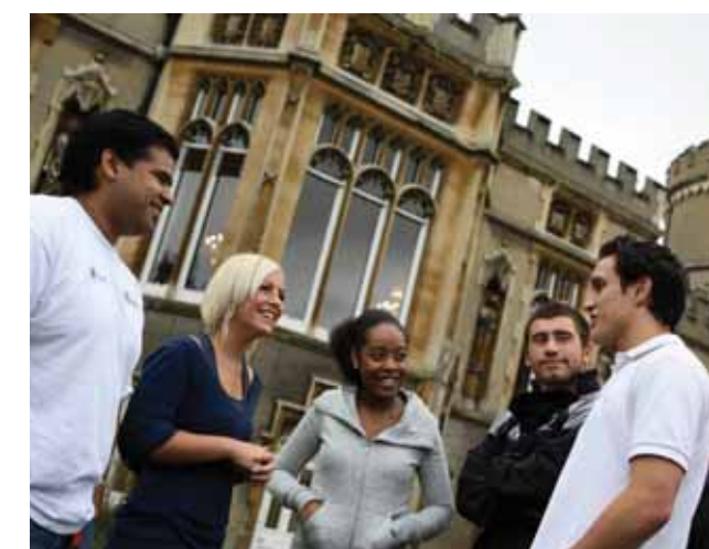
Students in London