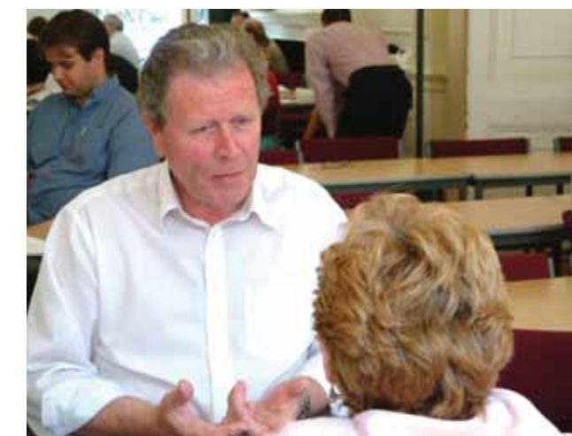
Developing specialised communication skills